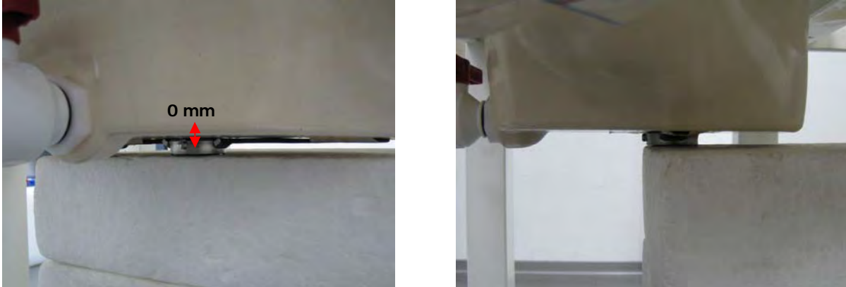
Fig.3 EUT Back side to flat phantom

Unless otherwise stated the results shown in this test report refer only to the sample(s) tested and such sample(s) are retained for 90 days only.