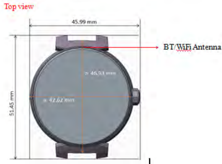
Fig.8 Antenna location (Front view)