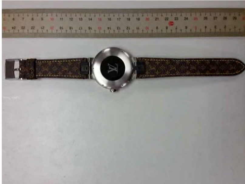
Fig.7 Back view of EUT