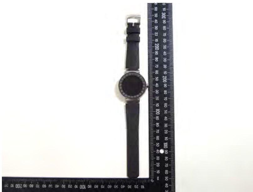
Fig.6 Front view of EUT

Unless otherwise stated the results shown in this test report refer only to the sample(s) tested and such sample(s) are retained for 90 days only.