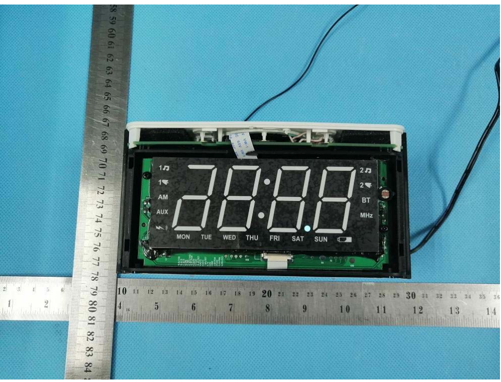
Inside View of The Product