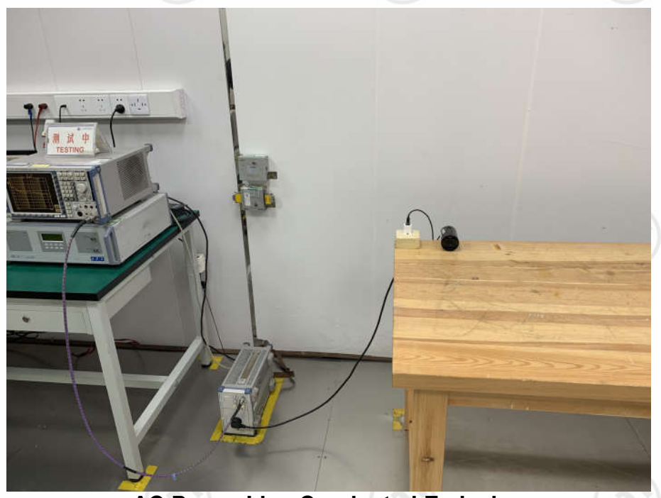
AC Power Line Conducted Emission