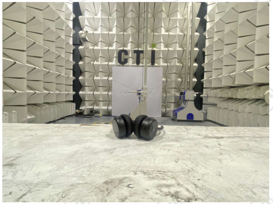
Radiated spurious emission Test Setup-2(Below 1GHz Close up)