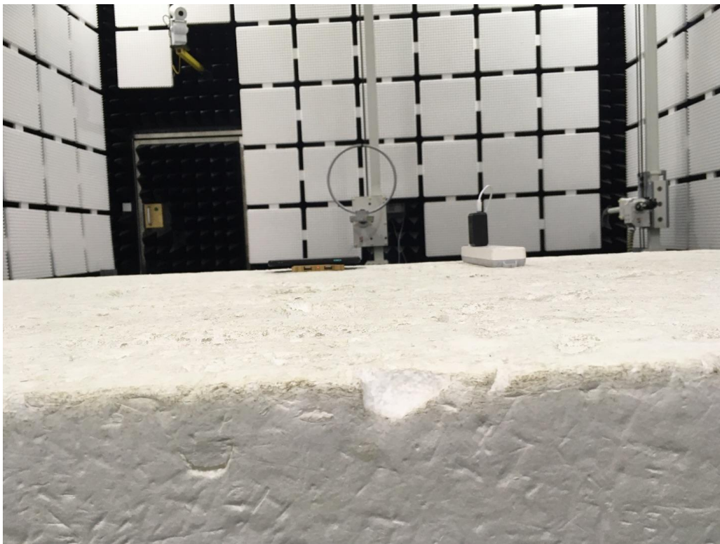
Radiated Emission below 30MHz-DC adapter charge mode