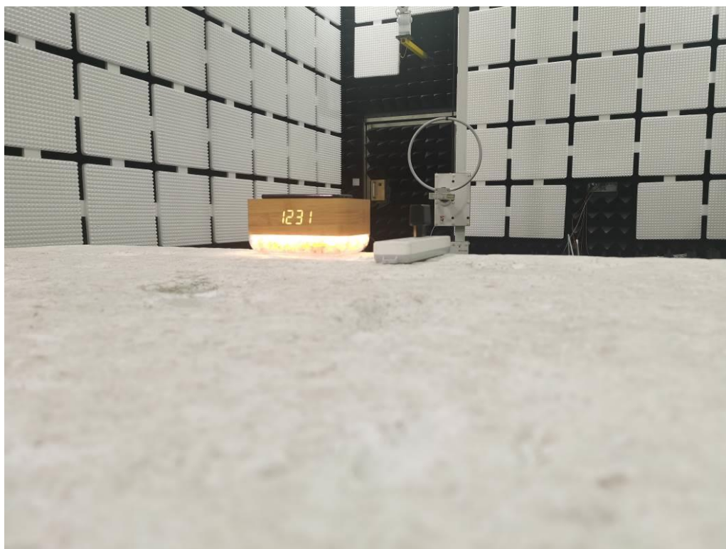
Radiated Emission below 30MHz-DC adapter charge mode