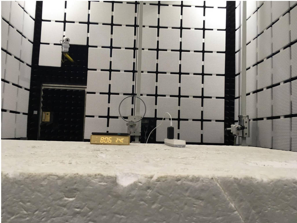
Radiated Emission below 30MHz-DC adapter charge mode