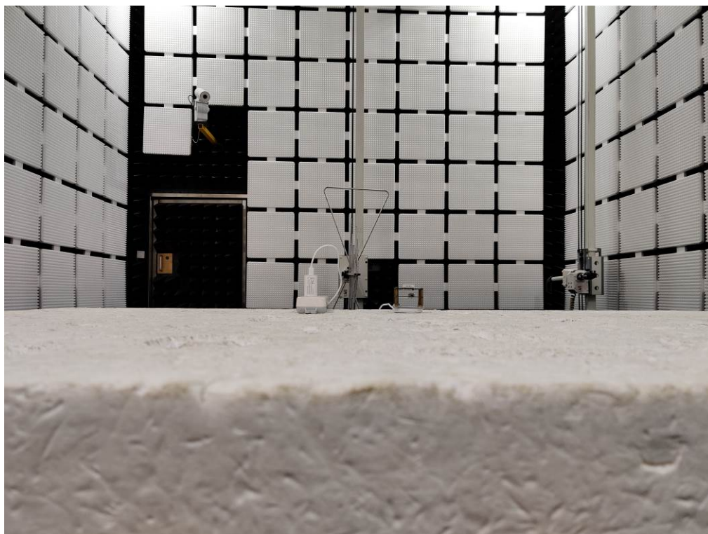
Radiated Emission Below 1 GHz