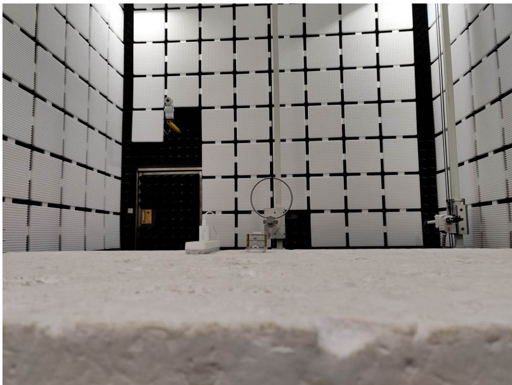
Radiated Emission below 30MHz-DC adapter charge mode