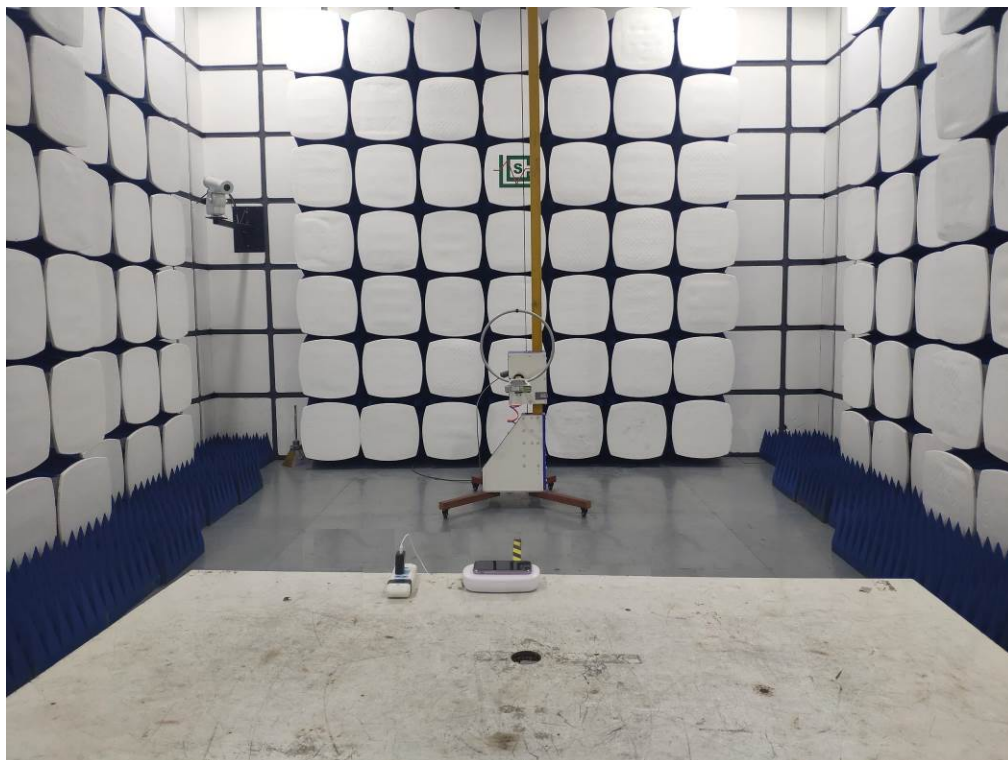
Radiated Emission below 30MHz-AC adapter charge mode