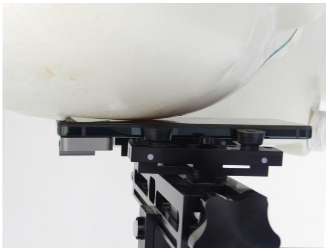
Right Cheek (Phone with headset)