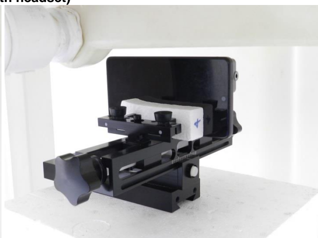
Left side with 10 mm separation distance (Phone with headset)