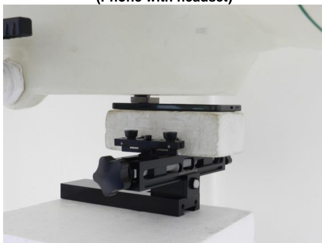
Back surface with 10 mm separation distance, for WLAN 5GHz Antenna 1 (Phone with headset)