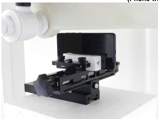
Right side with 10 mm separation distance (Phone with headset)