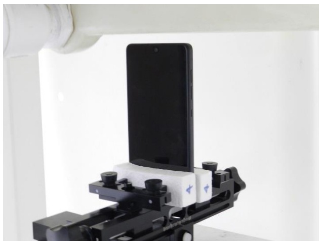
Top side with 10 mm separation distance (Phone with headset)