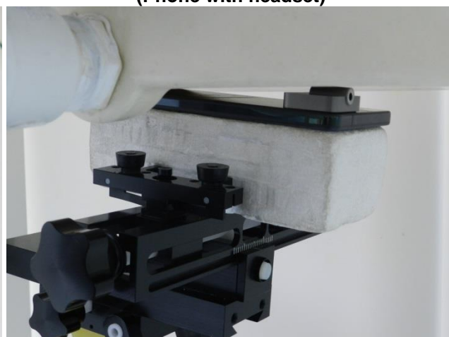
Back surface with 0 mm separation distance, for WLAN 2.4GHz Antenna 1 (Phone with headset)