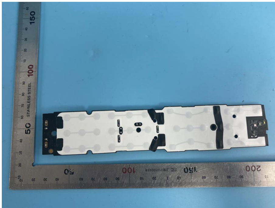
INTERNAL PHOTO OF SAMPLE PCB