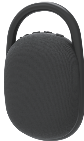
User Manual ITEM# AI9005