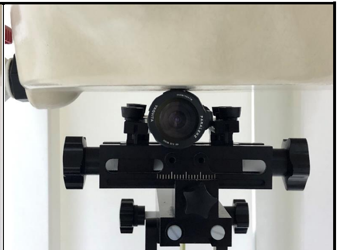
Right Side of EUT with 0 cm Gap