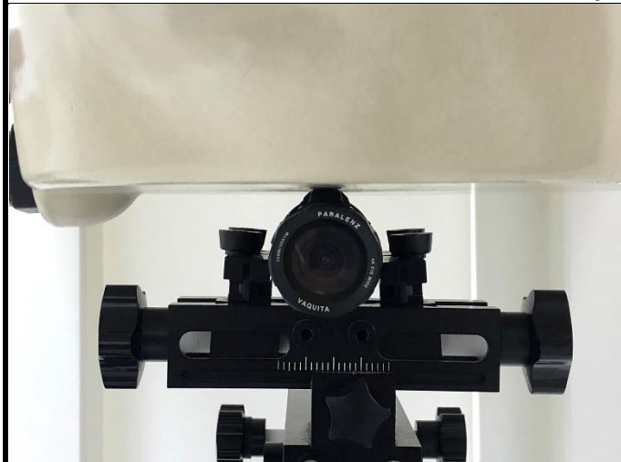
Top Side of EUT with 0 cm Gap