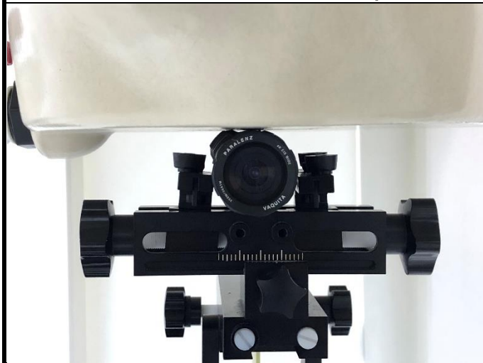
Curved surface of Left Side of EUT with 0 cm Gap