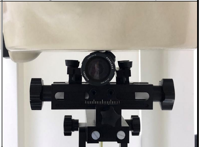
Curved surface of Right Side of EUT with 0 cm Gap