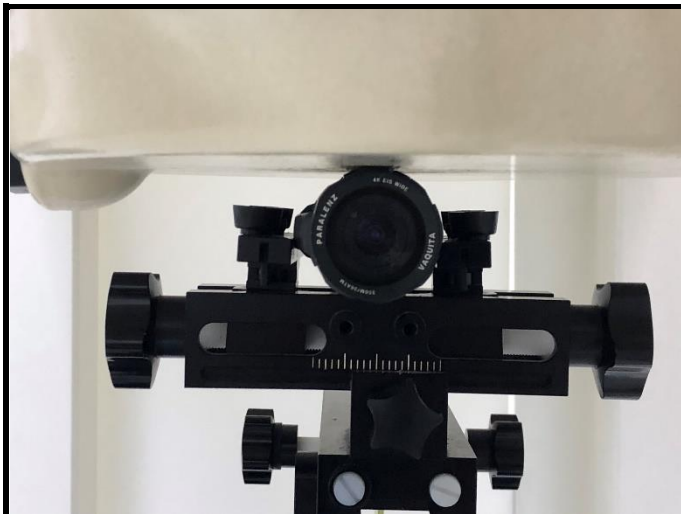
Left Side of EUT with 0 cm Gap