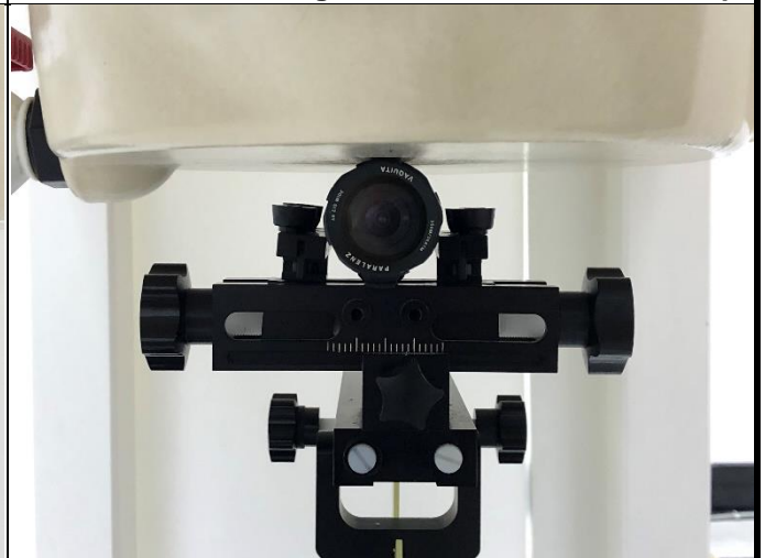
Bottom Side of EUT with 0 cm Gap