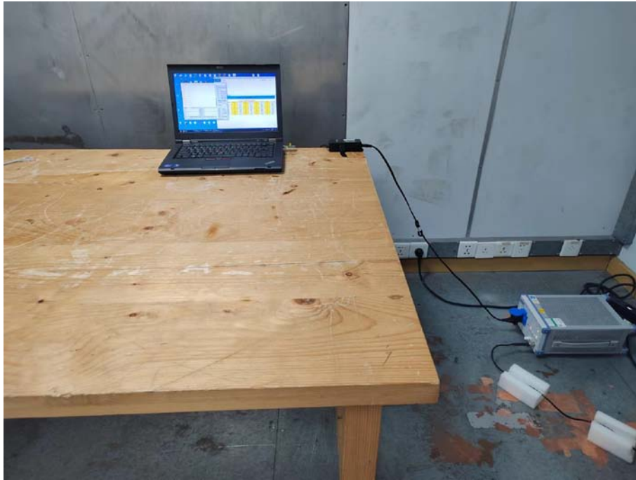
Photo of Power Line Conducted Emission Measurement