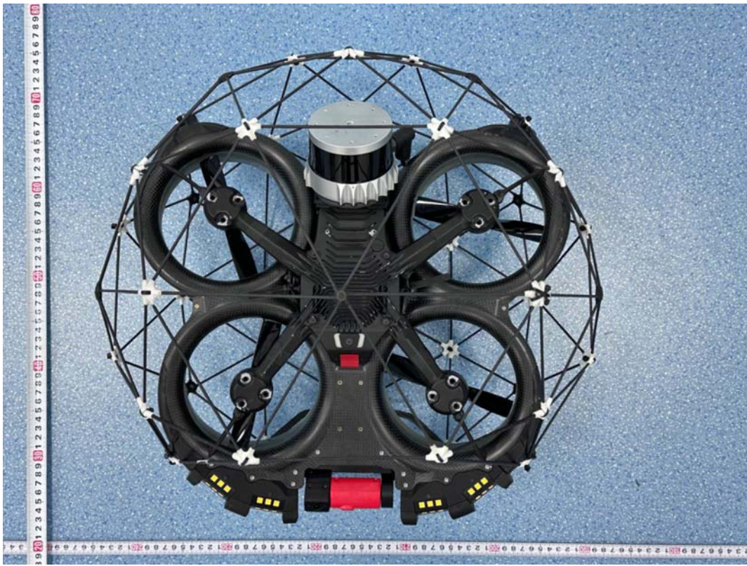
EXHIBIT B - EUT EXTERNAL PHOTOGRAPHS