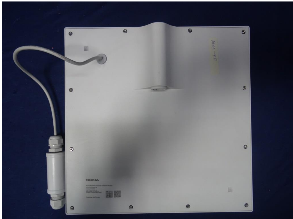
EUT Rear View