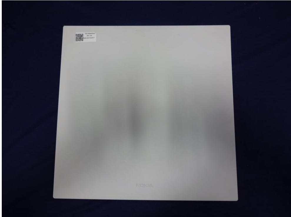
EUT Top view