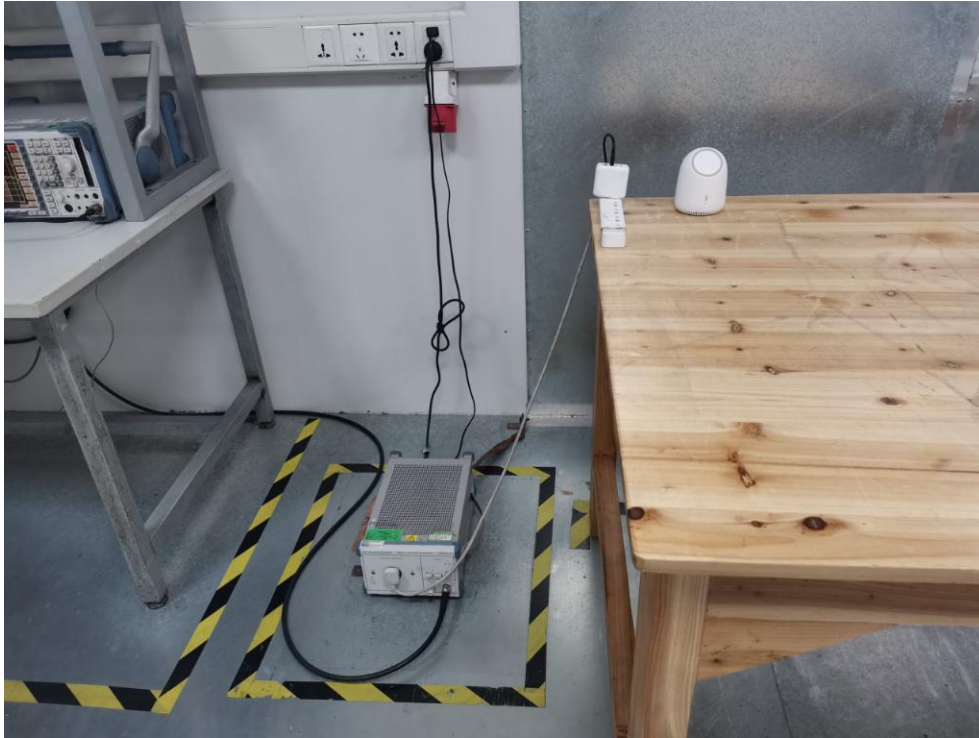
Photo of Radiation Emission Test