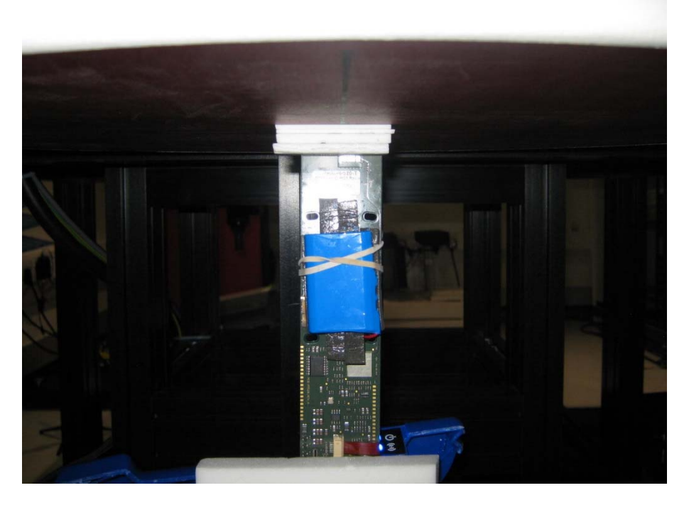
SAR - Bottom Edge (PCB) - 14mm Separation Distance