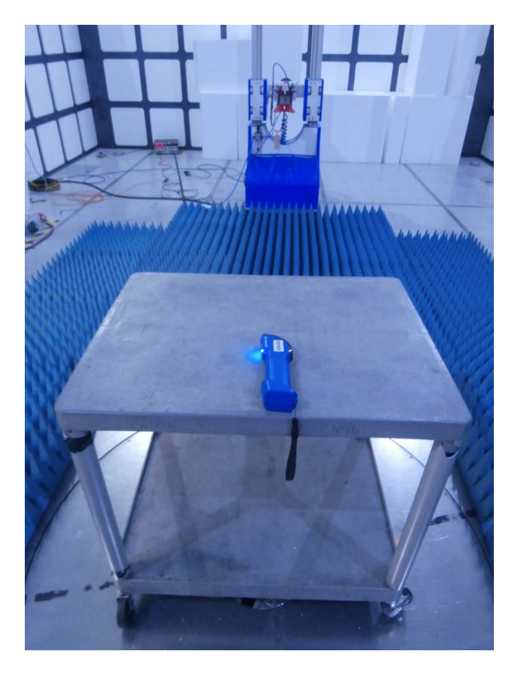
Radiated Emissions 1 GHz to 18 GHz

BCF Technology Limited Pig Scanner, Model: Duo-Scan:Go Plus