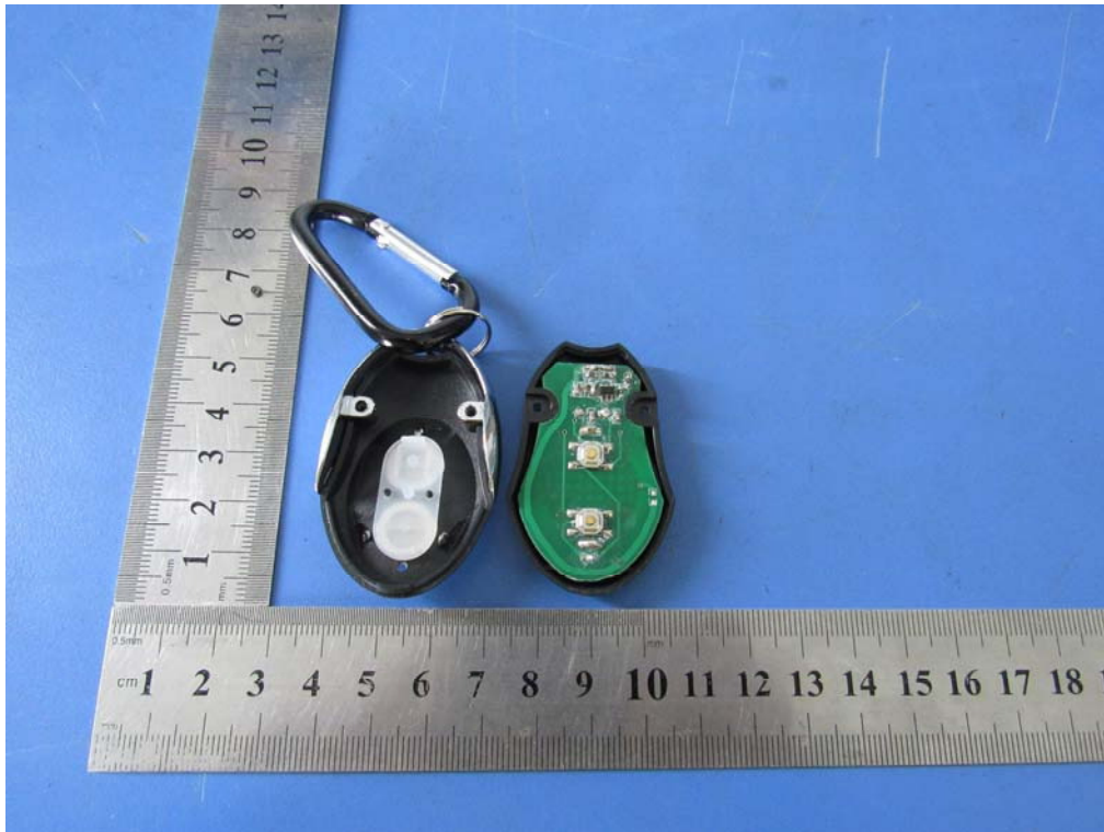
EUT Uncover– Front View