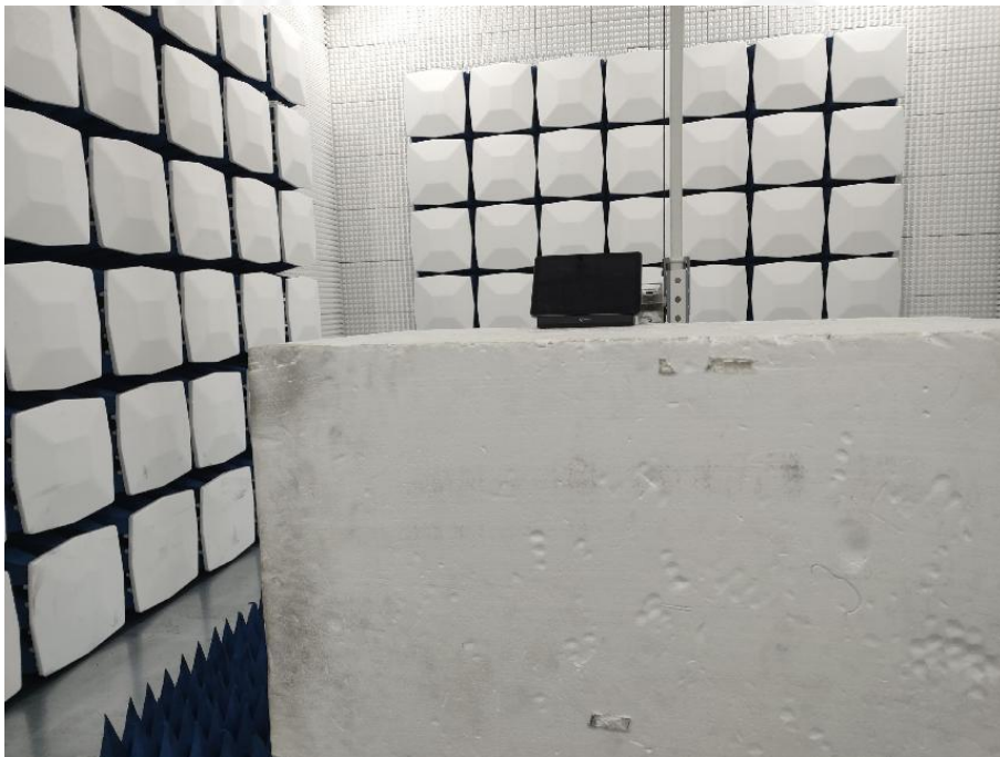
High frequency radiation (Above 1G)