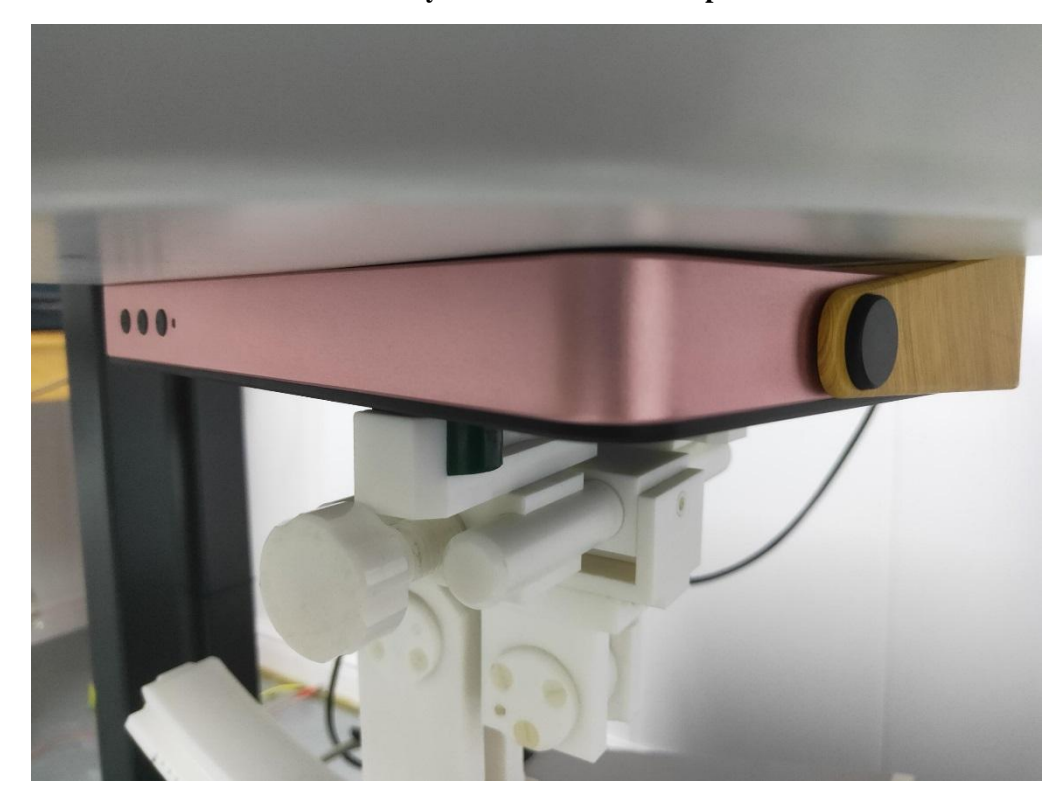
0mm body-worn Back Side Setup Photo