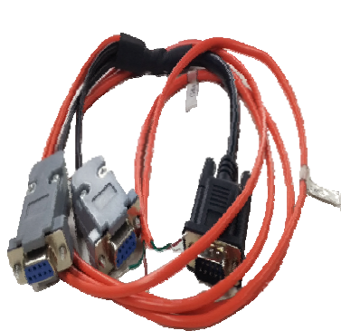
DB9 Special Extension Wire

Figure 2-4 is the picture of accessories for WB-L20B, orderly are DB9 special extension wire, cigar lighter power cord. For DB9 special extension wire, one end is DB9 male, on the other side are two DB9 female (DB9 female I is standard RS232, DB9 female II is a serial port for debugging) and two CAN interfaces (brown line connects to low level, green line connects to high level). Power cord can access to 9v ~ 36v DC input (it is recommended to use 12v DC input).