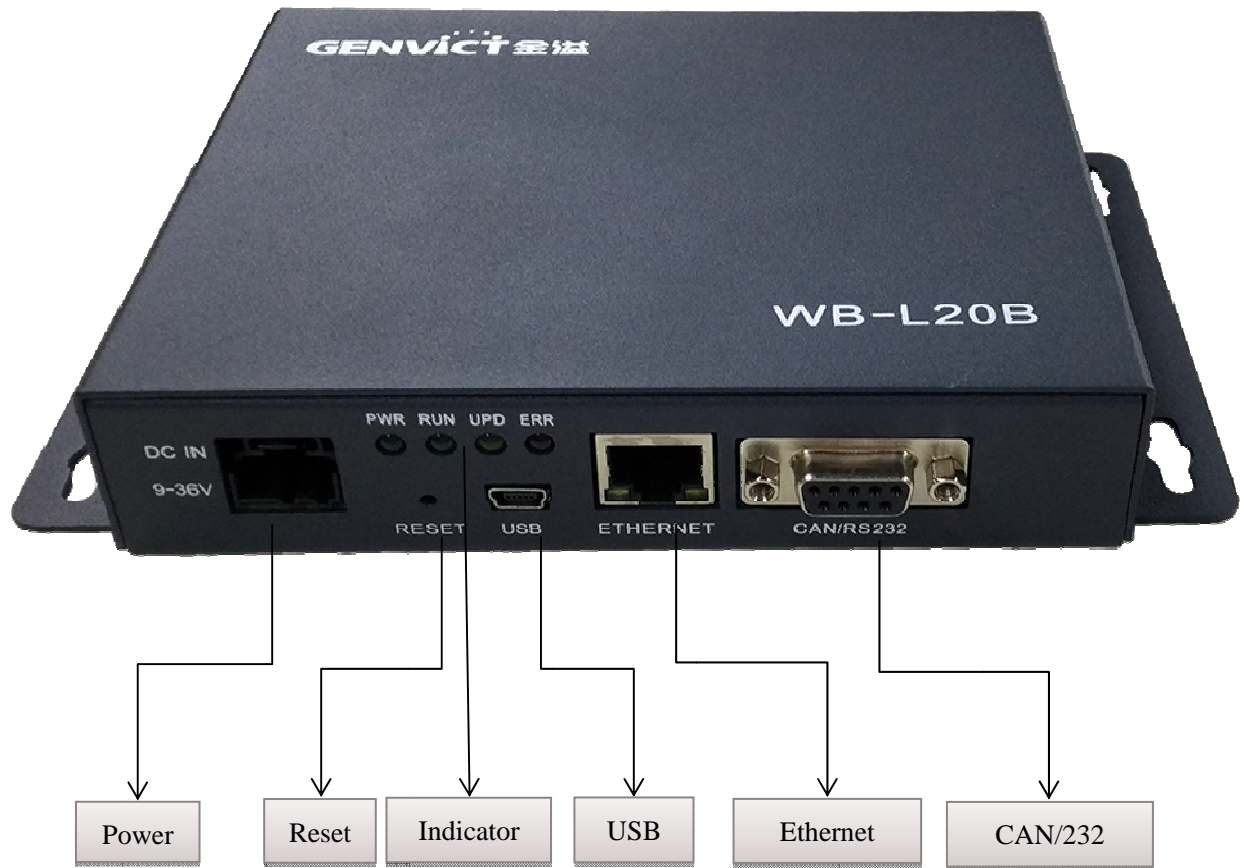
Figure 1-1 WB-L20Front Panel