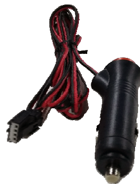
Cigar Lighter Power Cord