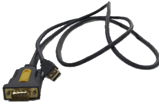
Figure 2-5 DB9 Serial Port Wire

WB-L20B provides mini- B USB male interface, it can be used for installing programs and transferring data with external devices. Figure 2-5 is DB9 serial port wire. To access WB-L20B by PC, one can use this wire connect to serial I of DB9 special extension wire (cable is optional).