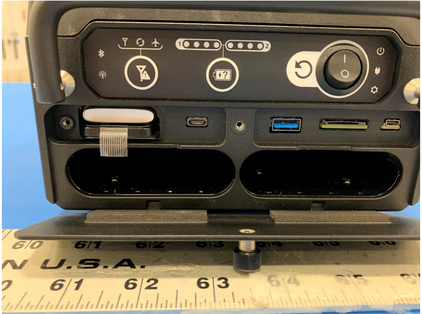
Unit Front – Door Open