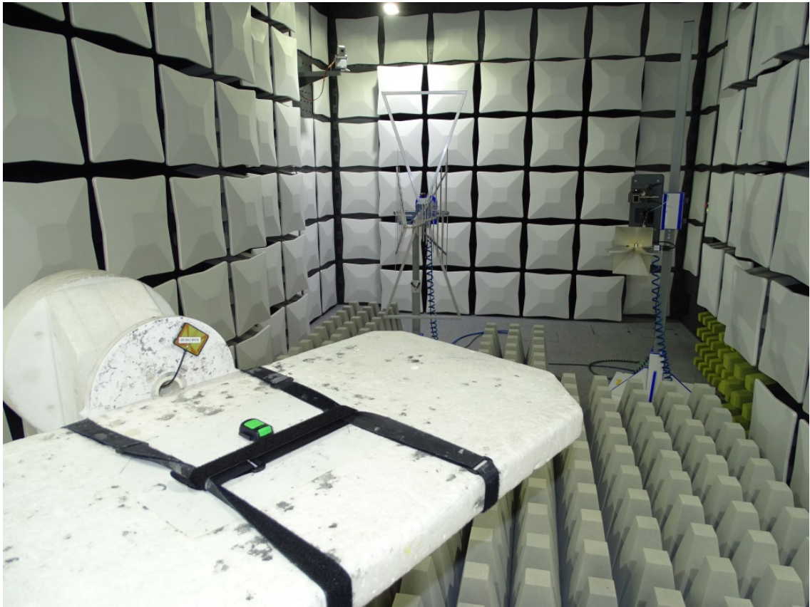
Photo 1: Test setup for radiated measurements (Enclosure, fully-anechoic chamber, 1-18 GHz intentional radiator §15 / 30 MHz – 10/20 GHz §22/24/27)