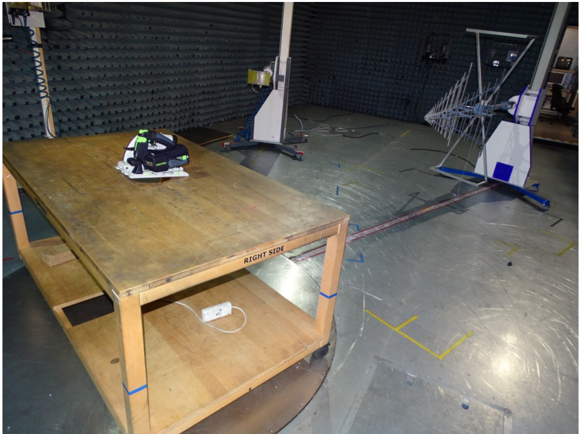
Photo 2: Test setup for radiated measurements (Enclosure, semi-anechoic chamber, 30 MHz to 1 GHz, intentional radiator §15, ANSI C63.10)