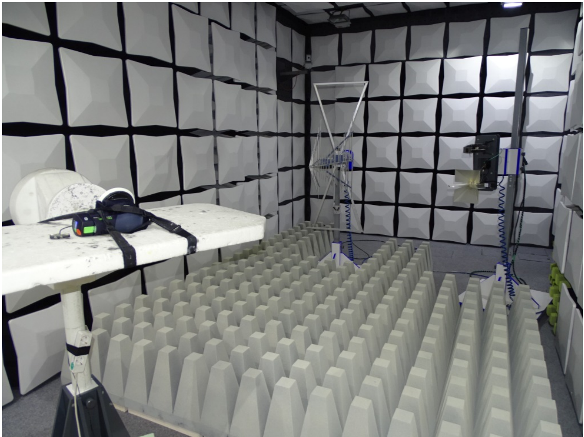
Photo 3: Test setup for radiated measurements (Enclosure, fully-anechoic chamber, 1-26 GHz intentional radiator §15, ANSI C63.10)