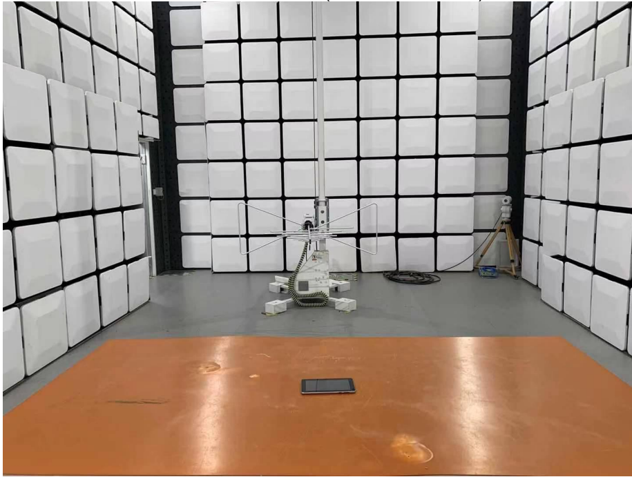
Radiated Emissions (Above 1GHz)