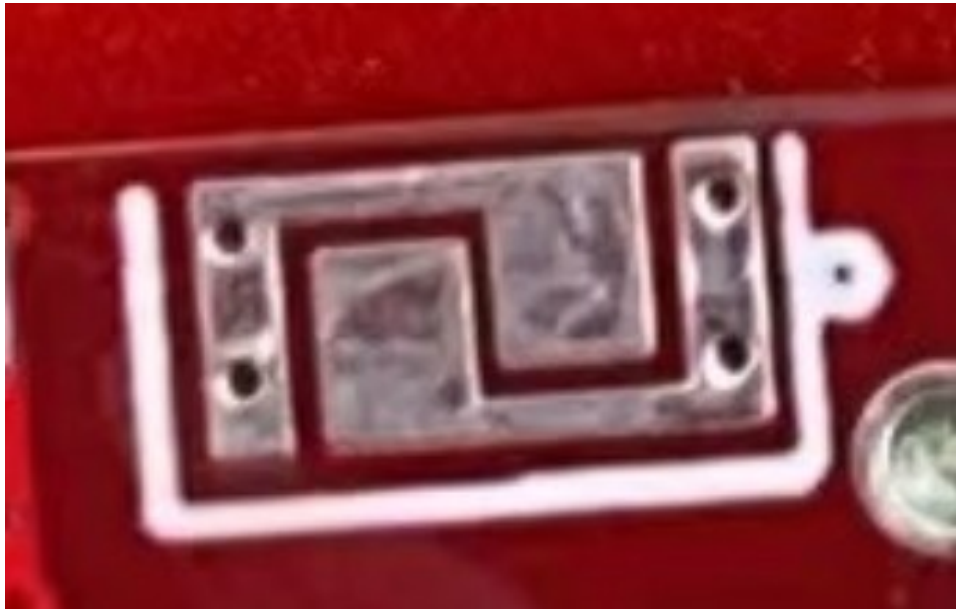
Antenna Photo & Size