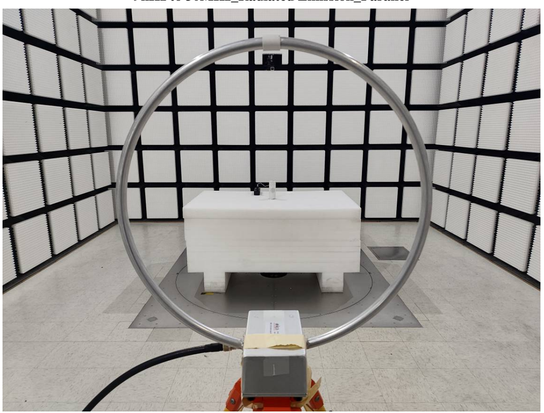
9kHz\ to\ 30MHz\_Radiated\ Emission\_Perpendicular