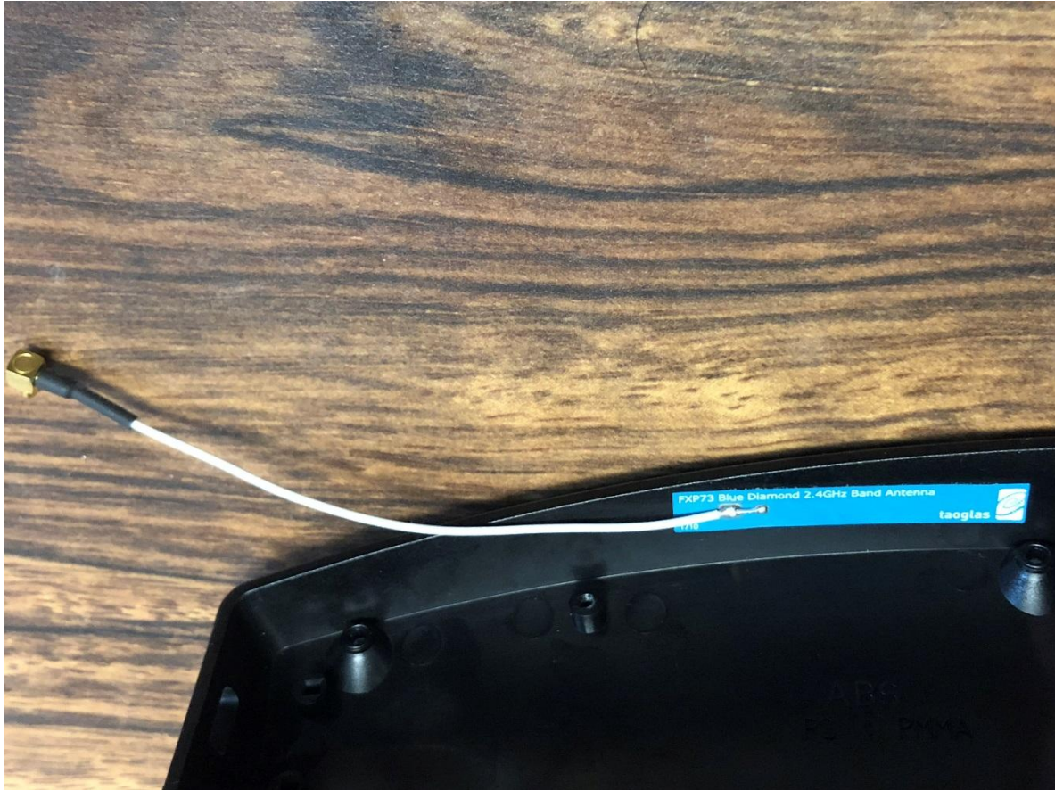
Figure 2. Antenna to be Added

FCC Part 15 Class II Permissive Change 2AKZ5-CDSVN210ISA 19-0203 June 3, 2019 Control Data Systems VN210