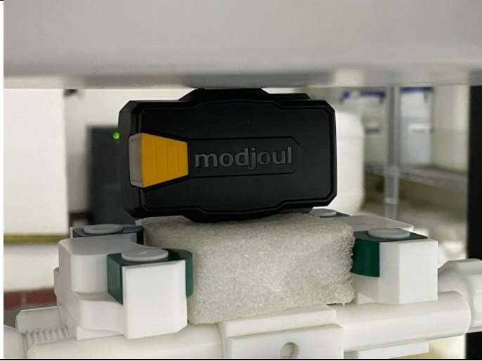
Top side (Separation distance of 0mm)