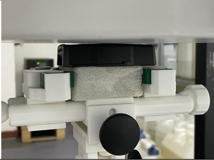
Front Side (Separation distance of 0mm)