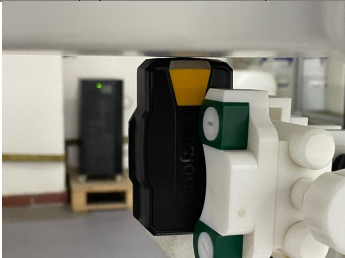
Left side (Separation distance of 0mm)