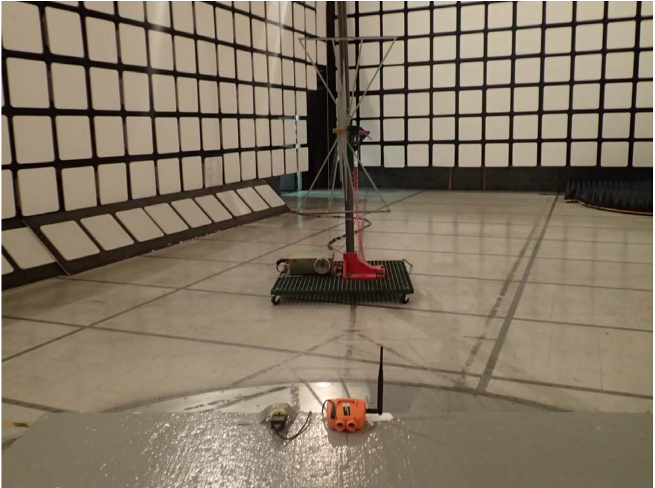
Radiated Emissions @ 3 m, Orthogonal Position 1 EUT in Host Device (Alert Labs Sumpie Sump Pump Monitor)