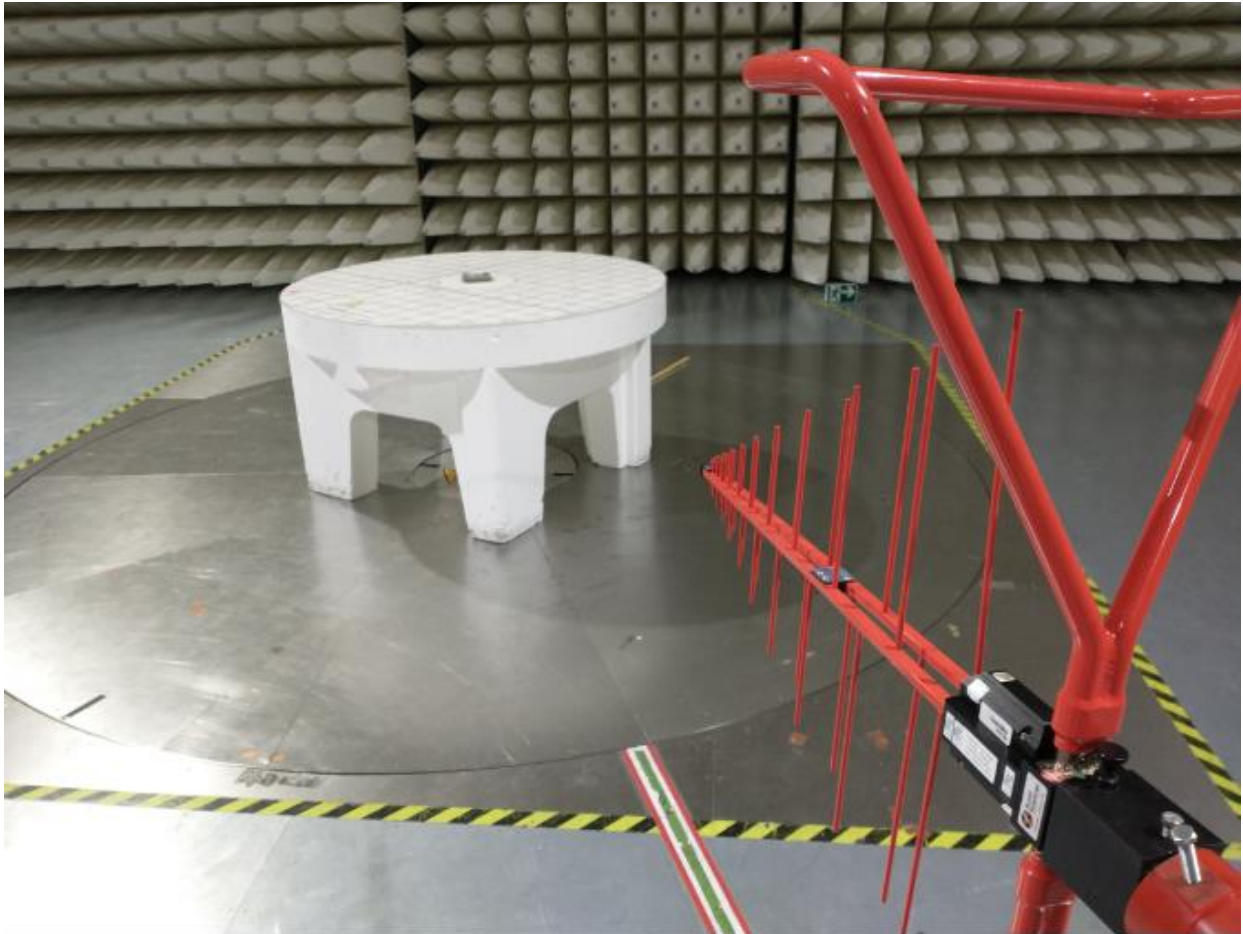
Figure 1: Test Setup for 30 MHz to 1000MHz (Front View)