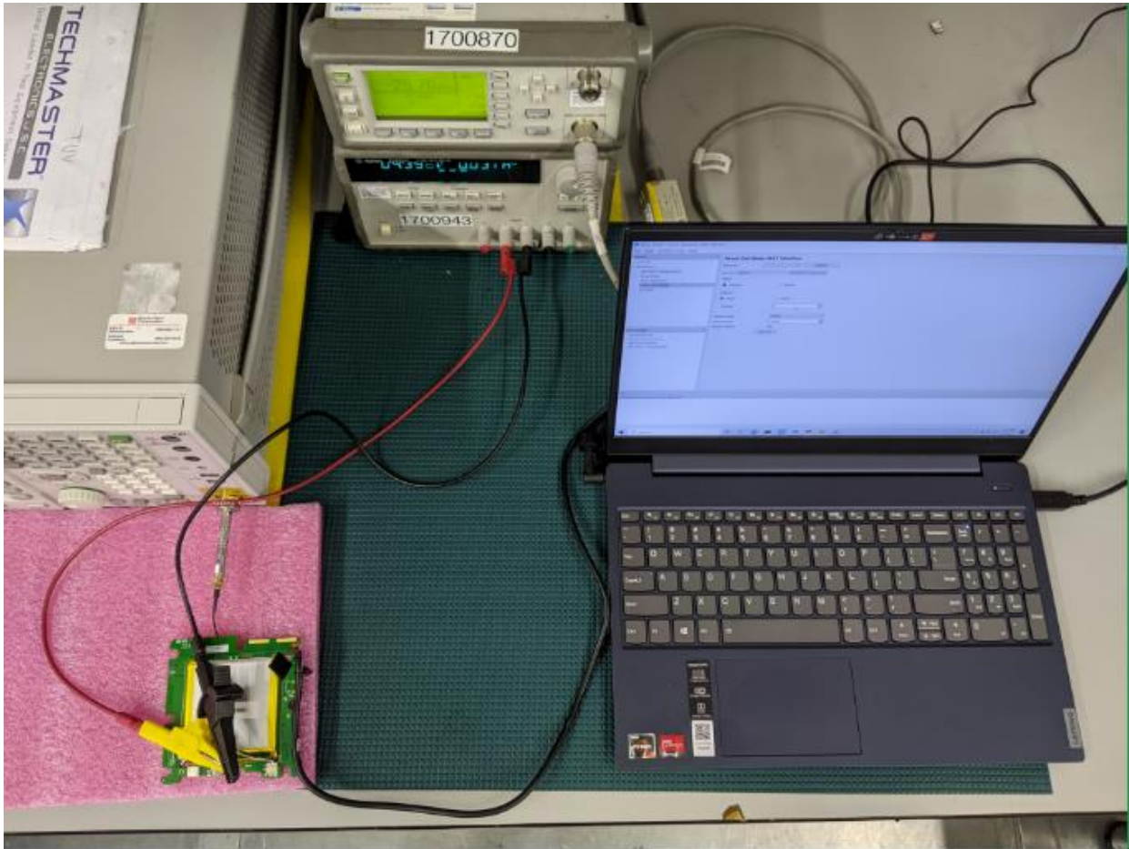
Figure 4: RF Conducted Test Setup – Closeup