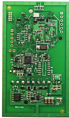
VIEW - PCB BOTTOM ▲