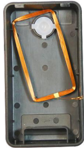
VIEW - REVERSE ▲ internal view part assembled + ANTENNA