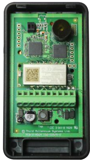
VIEW - REVERSE ▲ internal view assembled + PCB top view (reader unpotted)