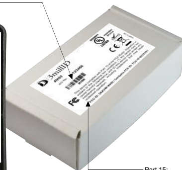
Part 15: FCC warning statement