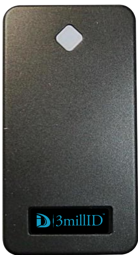
VIEW - OBVERSE ▼