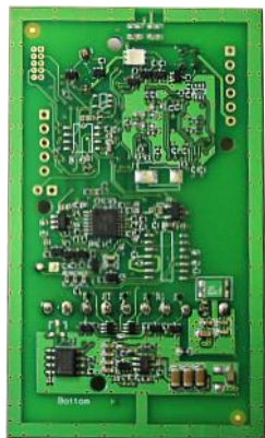
VIEW - PCB BOTTOM ▲