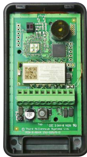
VIEW - REVERSE ▲ internal view assembled + PCB top view (reader unpotted)