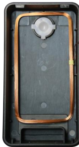
VIEW - REVERSE ▲ internal view part assembled + ANTENNA