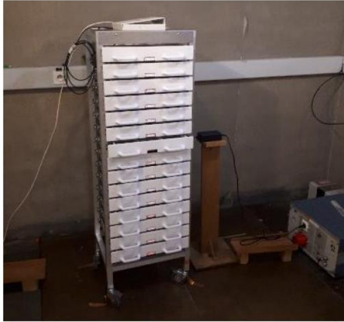
Photograph for AC Power Line Conducted Emissions (Front view)