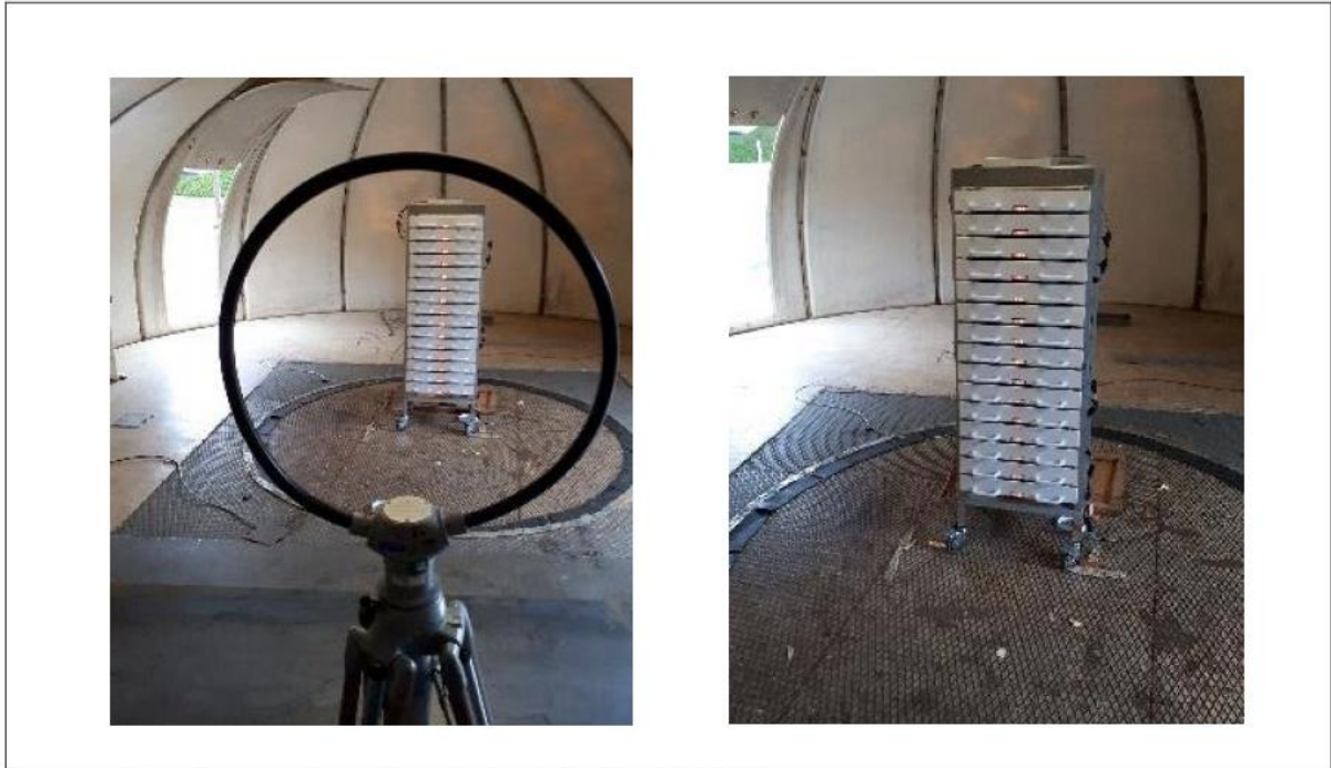
Photograph for Field strength outside of the bands 13.110-14.010 MHz