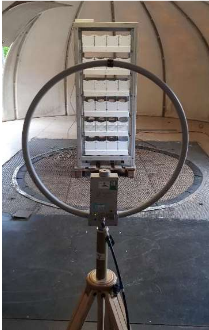
Field strength within the band 13.110-14.010MHz