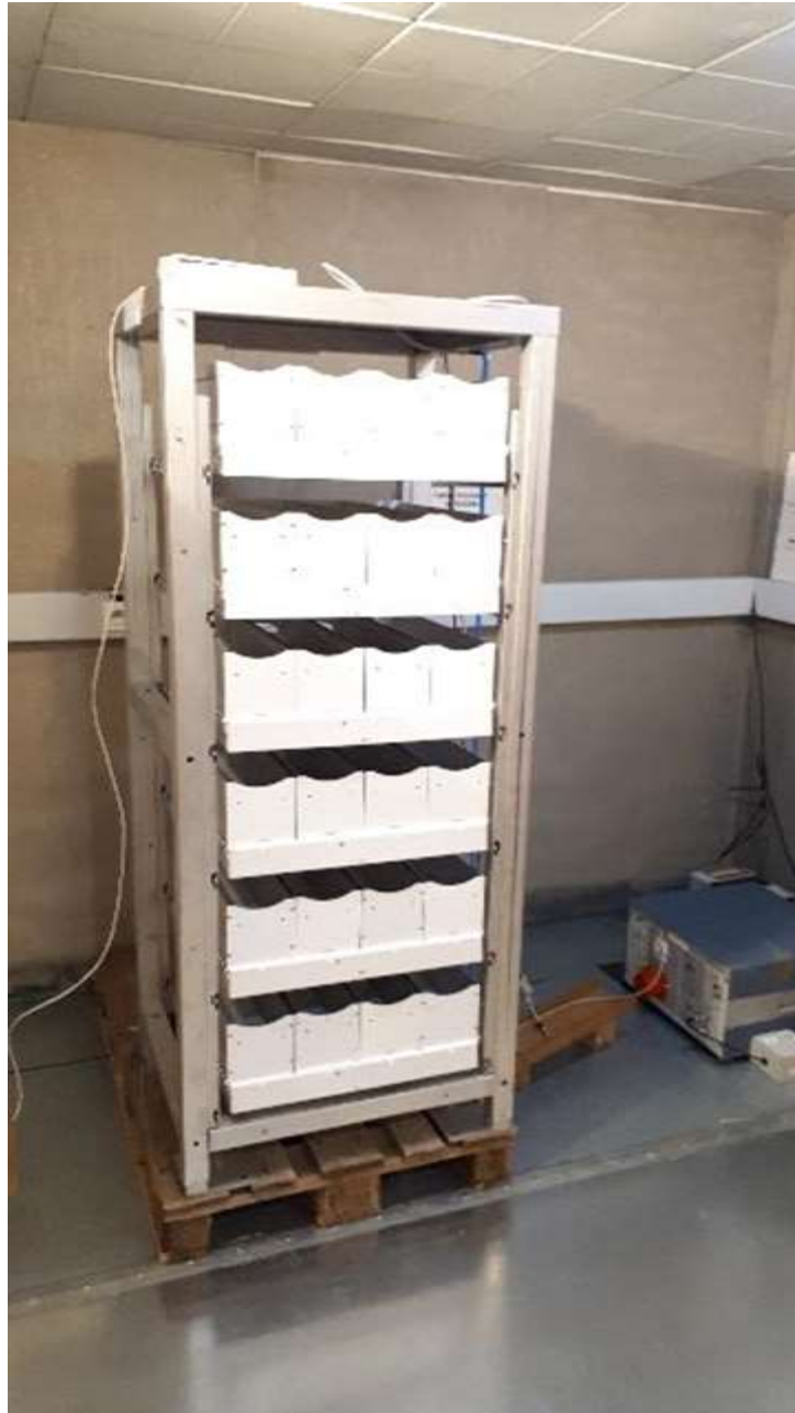
Conducted emission measurement (1)