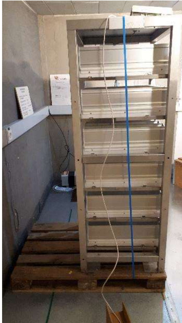
Conducted emission measurement (1)