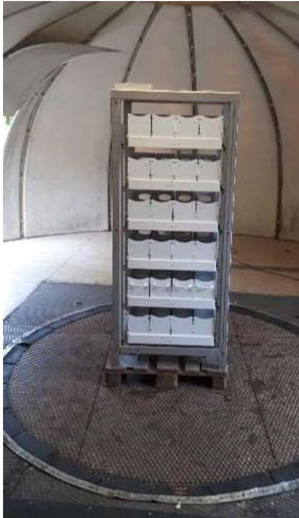
Field strength outside of the bands 13.110-14.010 MHz (1)