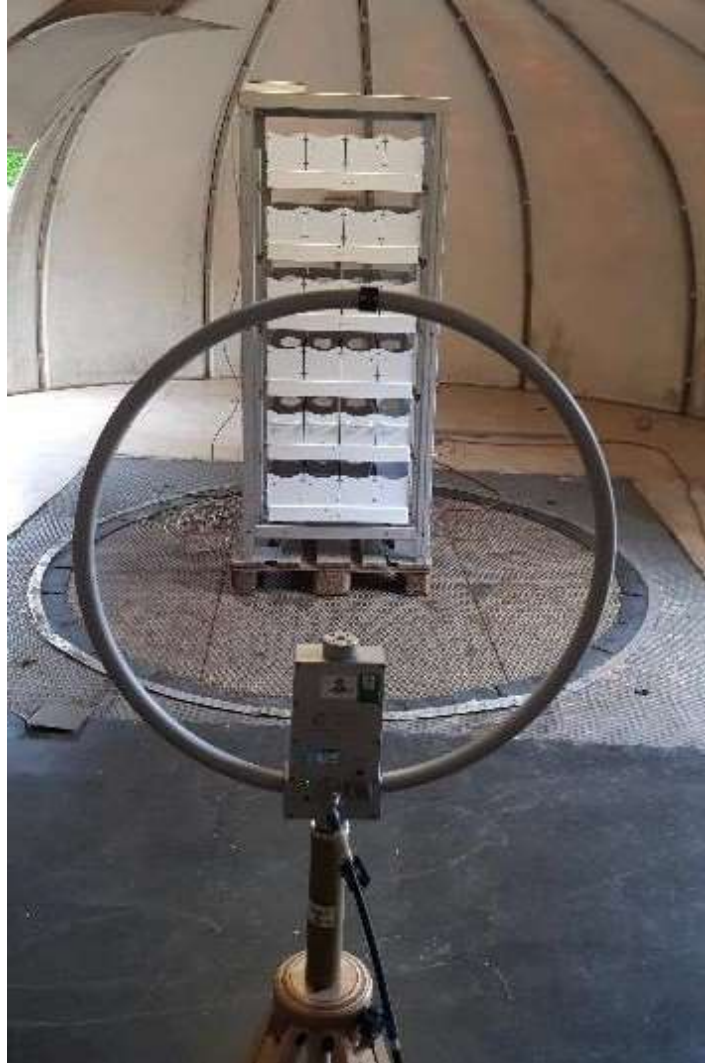
Field strength within the band 13.110-14.010MHz