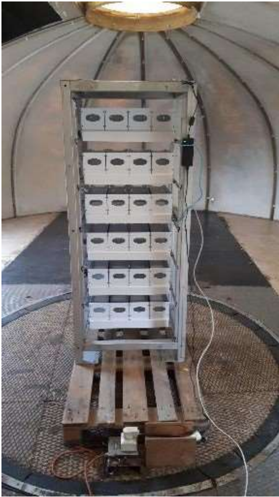
Field strength outside of the bands 13.110-14.010 MHz (2)