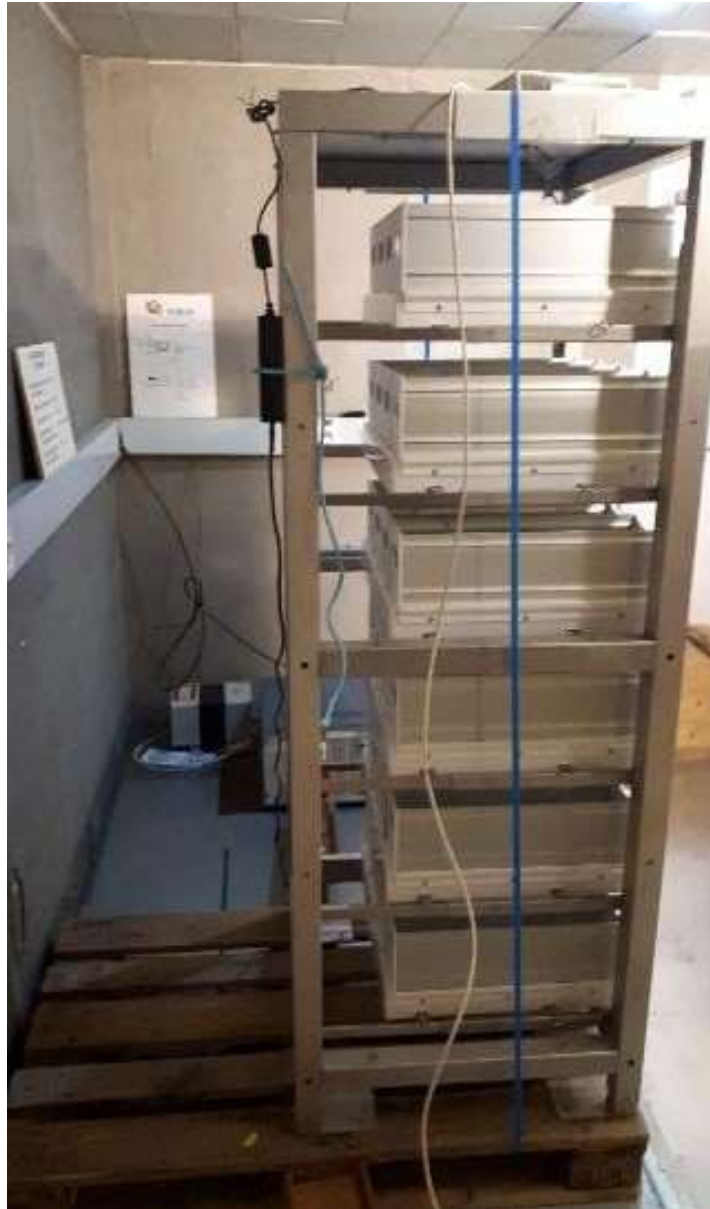
Conducted emission measurement (1)