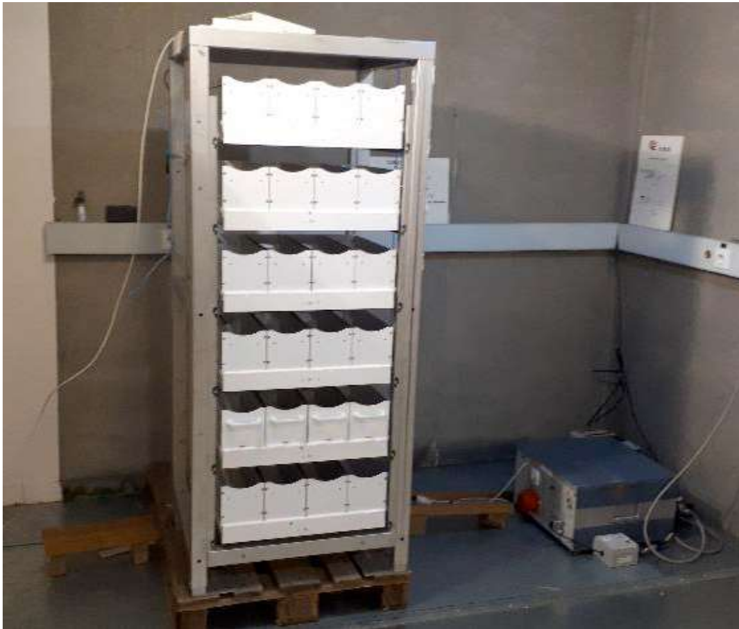
Conducted emission measurement (1)