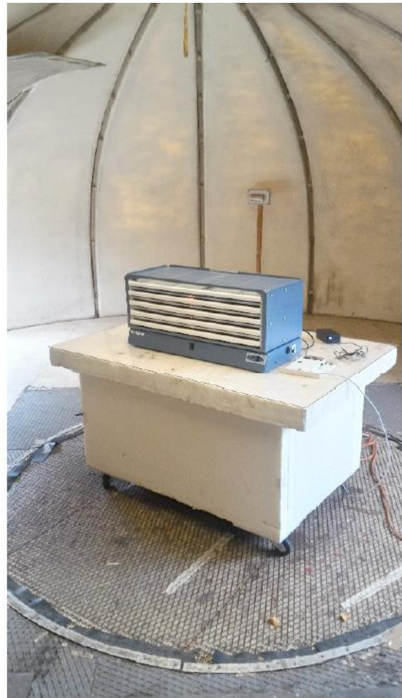
Photograph for Field strength outside of the bands 13.110-14.010 MHz