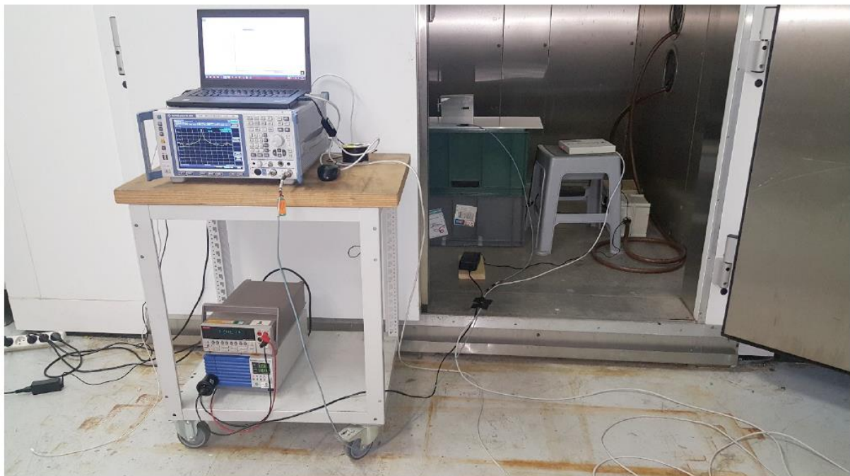
Photograph for Occupied bandwidth