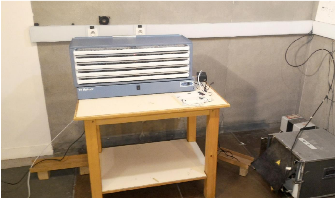
Photograph for AC Power Line Conducted Emissions (Front view)