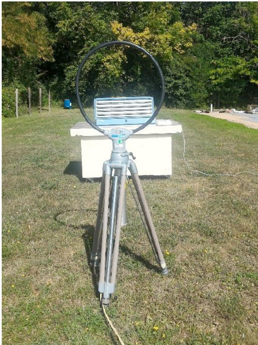
Photograph for Field strength within the band 13.110-14.010MHz