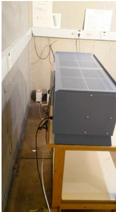
Photograph for AC Power Line Conducted Emissions (Rear view)