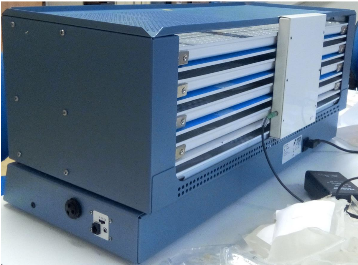
SST-A Rear view