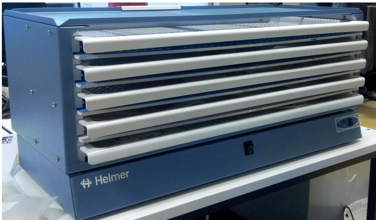
SST-A Front view