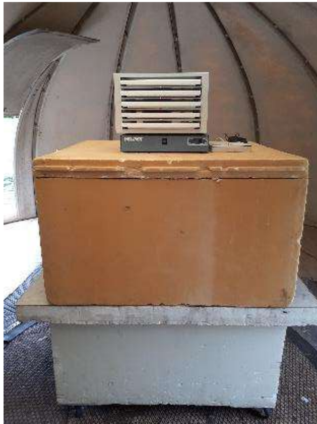
Field strength within the band 13.110-14.010MHz