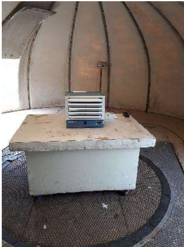
Field strength outside of the bands 13.110-14.010 MHz (1)