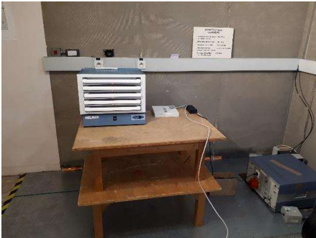
Conducted emission measurement (1)