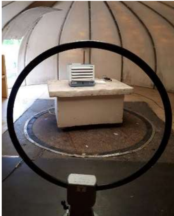
Field strength outside of the bands 13.110-14.010 MHz (2)