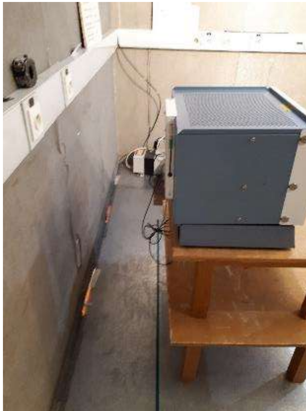
Conducted emission measurement (1)