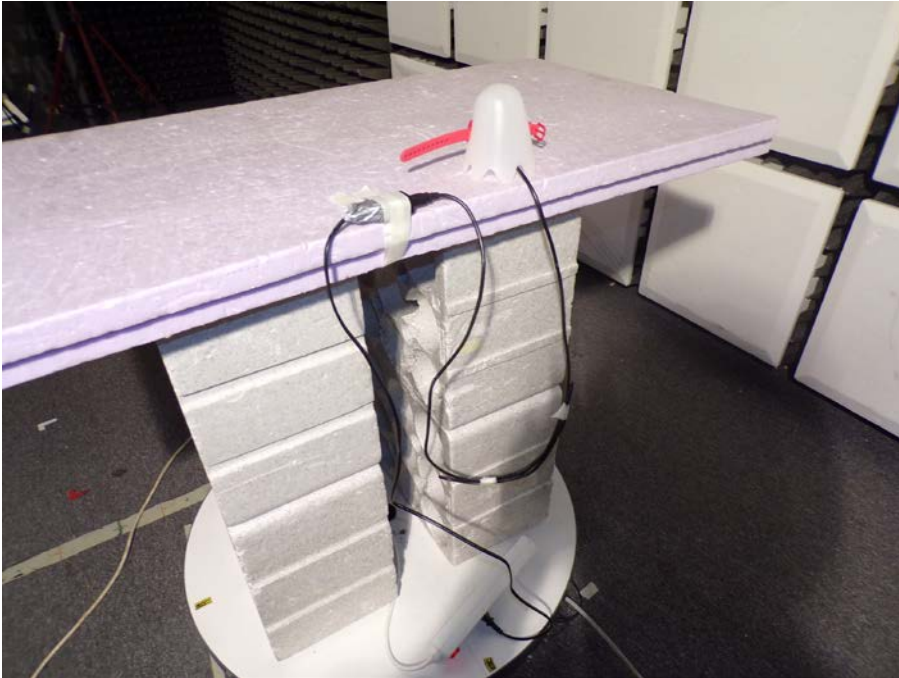
Test setup for radiated emission below 1GHz (Pre-scan in chamber, watch standing on the charging Companion)