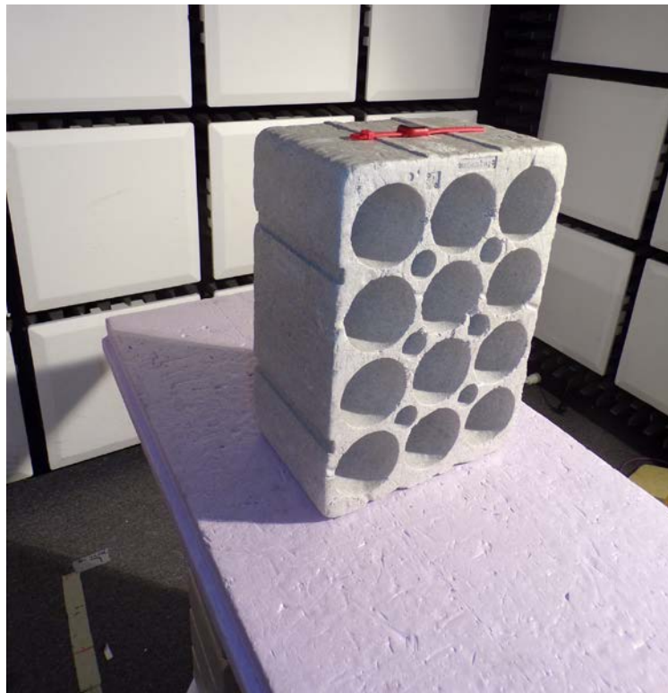
Test setup for radiated emission above 1GHz (Measurement in 3m chamber)