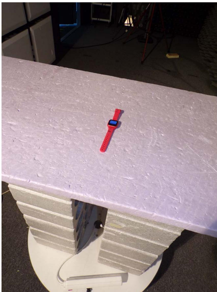
Test setup for radiated emission below 1GHz (Pre-scan in chamber, standalone watch)