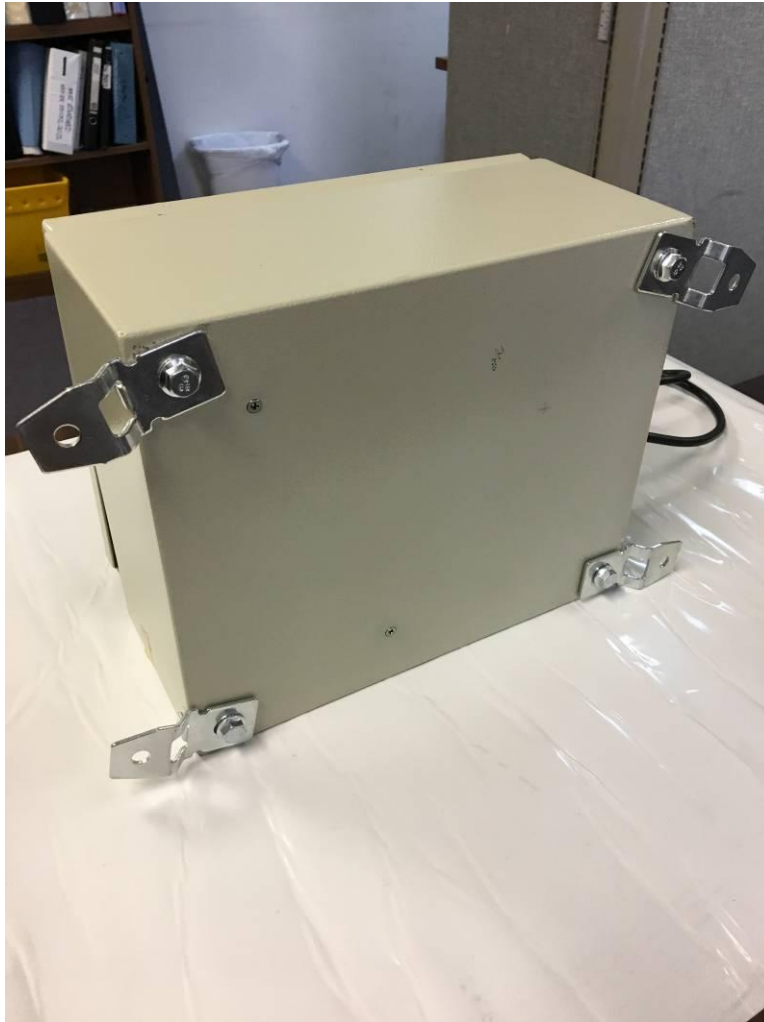
Figure 6. Back of EUT

FCC Part 90/RSS 131 Certification 2AKSM-SAFE1 22303-SAFE1 17-0001 March 20, 2017 Safe-Com Wireless SAFE 1000