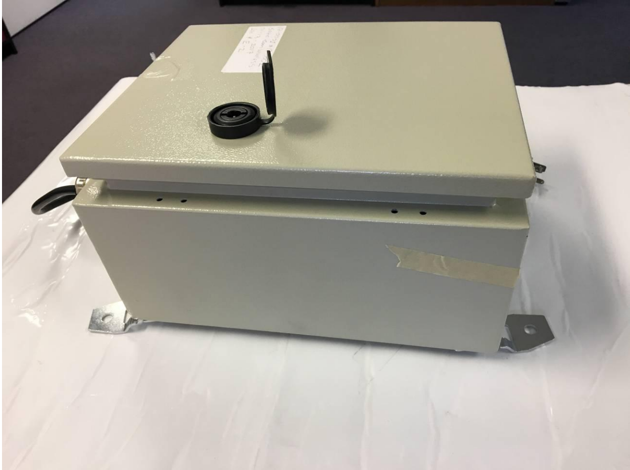
Figure 5. Side 2

FCC Part 90/RSS 131 Certification 2AKSM-SAFE1 22303-SAFE1 17-0001 March 20, 2017 Safe-Com Wireless SAFE 1000