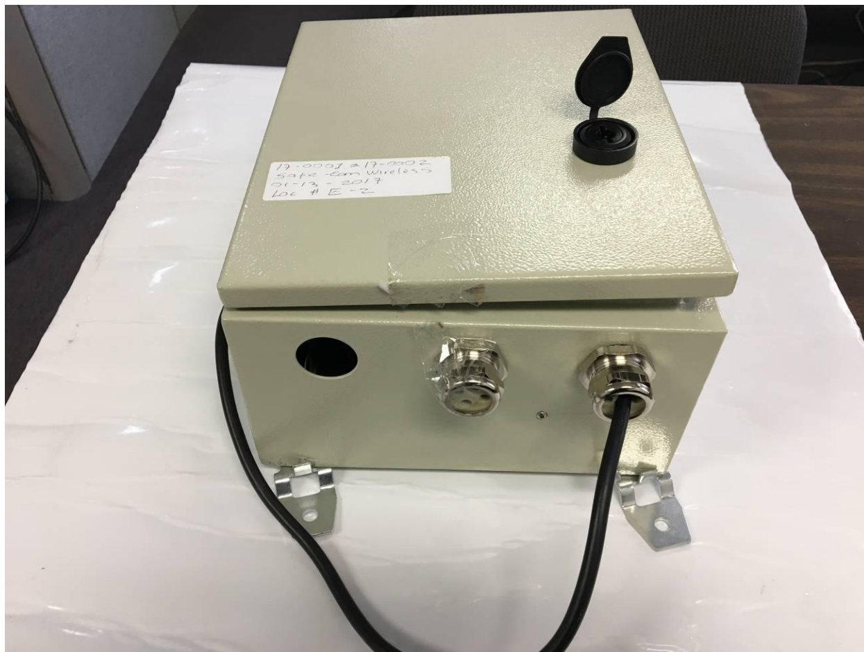
Figure 3. Bottom

FCC Part 90/RSS 131 Certification 2AKSM-SAFE1 22303-SAFE1 17-0001 March 20, 2017 Safe-Com Wireless SAFE 1000