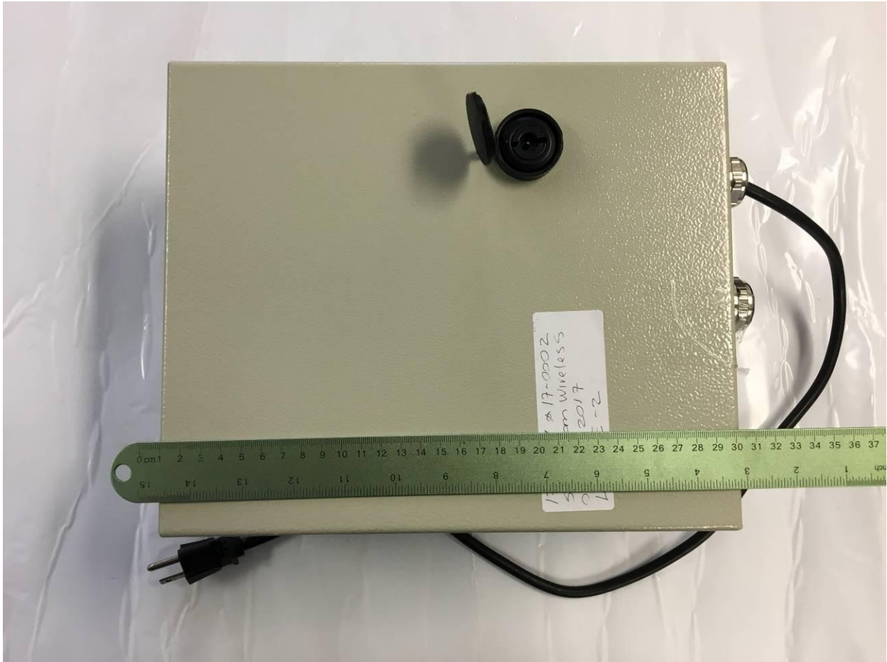
Figure 1. Remote Unit