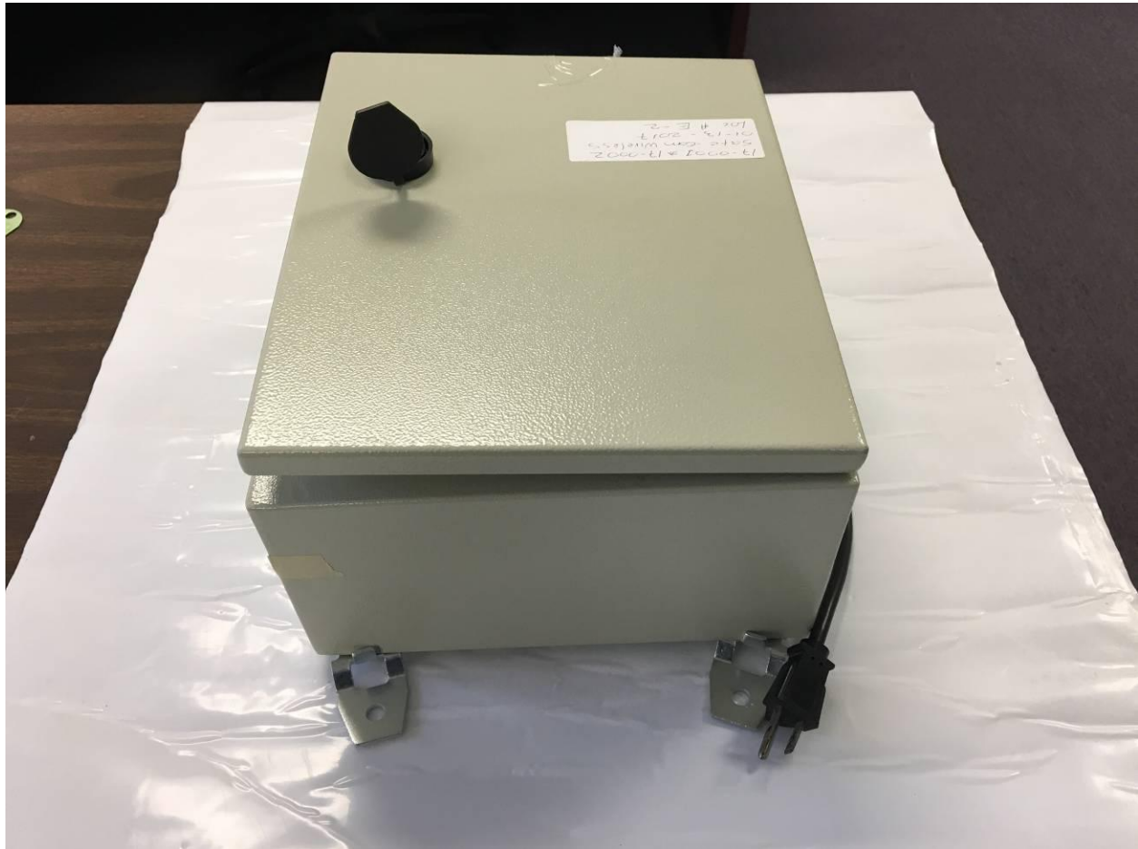
Figure 4. Top

FCC Part 90/RSS 131 Certification 2AKSM-SAFE1 22303-SAFE1 17-0001 March 20, 2017 Safe-Com Wireless SAFE 1000