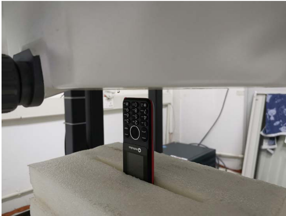
Body worn – Bottom (10mm)