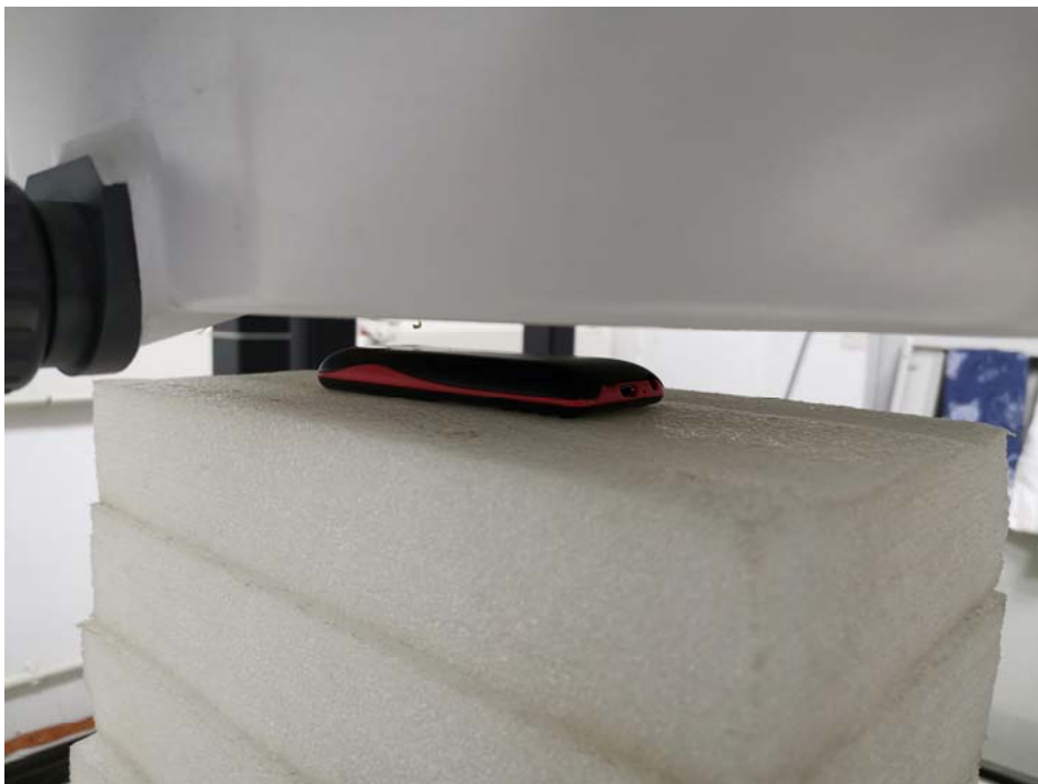
Body worn – Back (10mm)