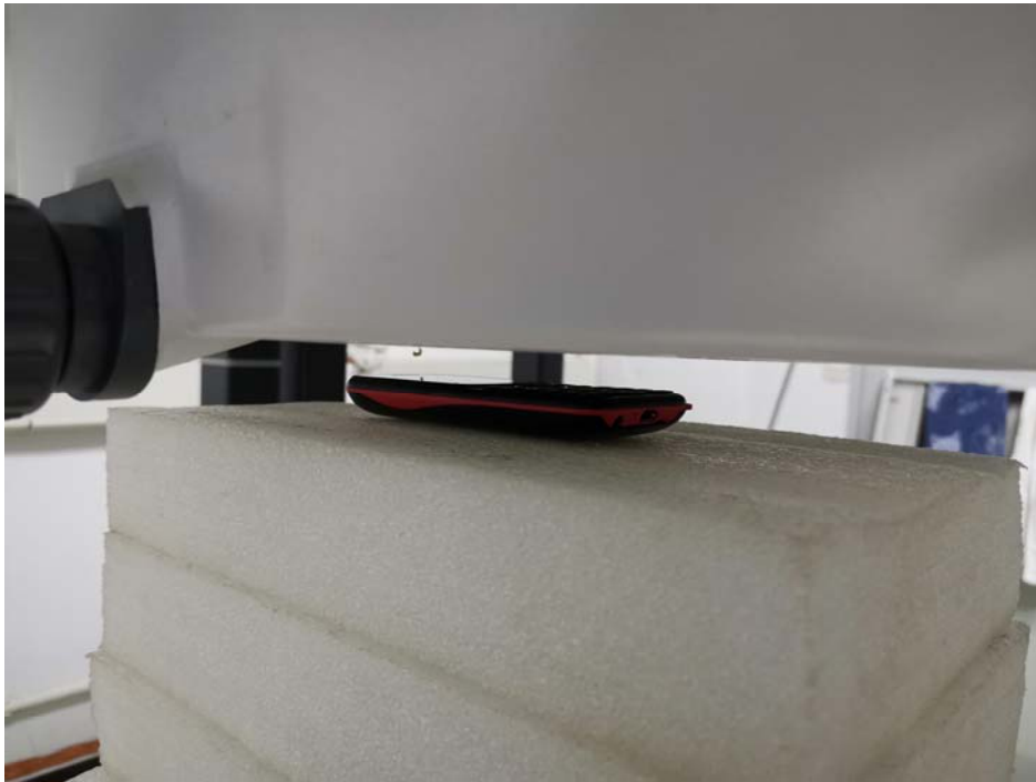
Body worn – Front (10mm)