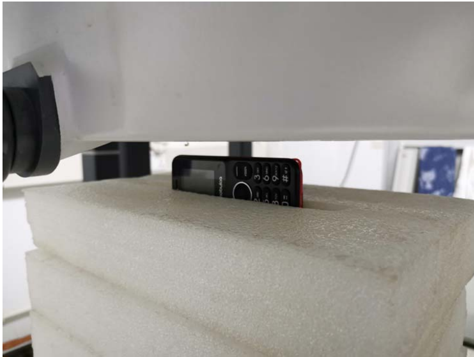
Body worn – Right (10mm)