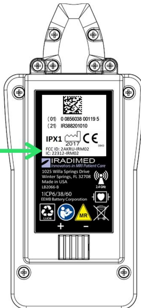
3882 WIRELESS SpO2 REAR VIEW