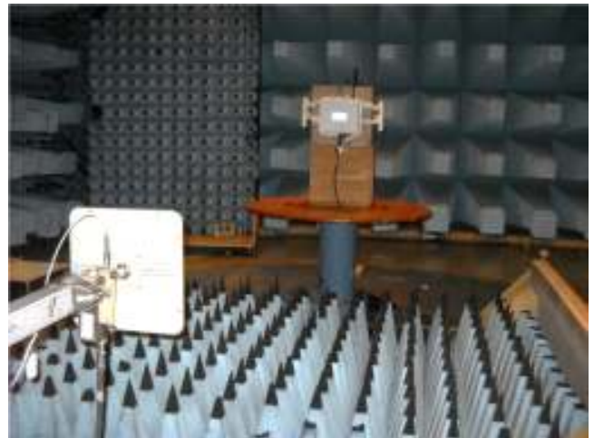
Radiated emissions above 1 GHz