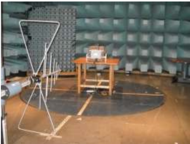
Radiated emissions below 1 GHz