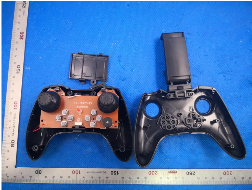
INTERNAL VIEW OF EUT (FIGURE 1)