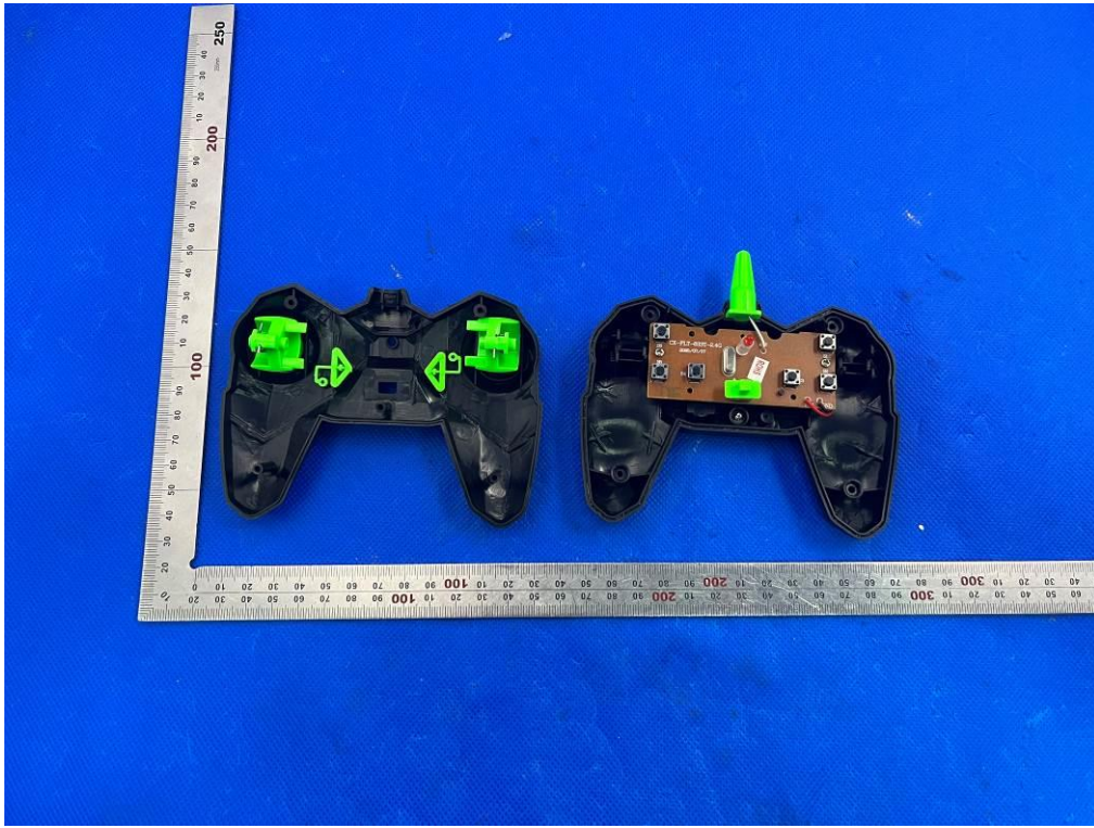
ANTENNA CLOSE-UP PHOTO-1