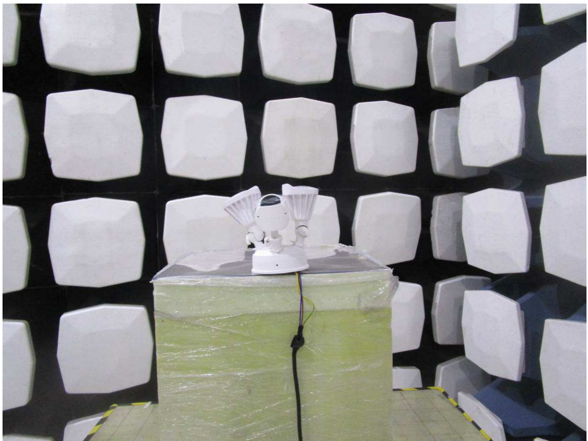
Above 1GHz (The EUT placed at the center of the turntable)