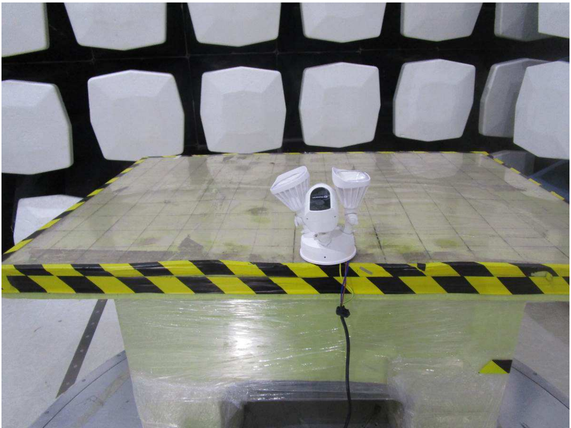
Up to 1GHz (The EUT placed at the center of the turntable)